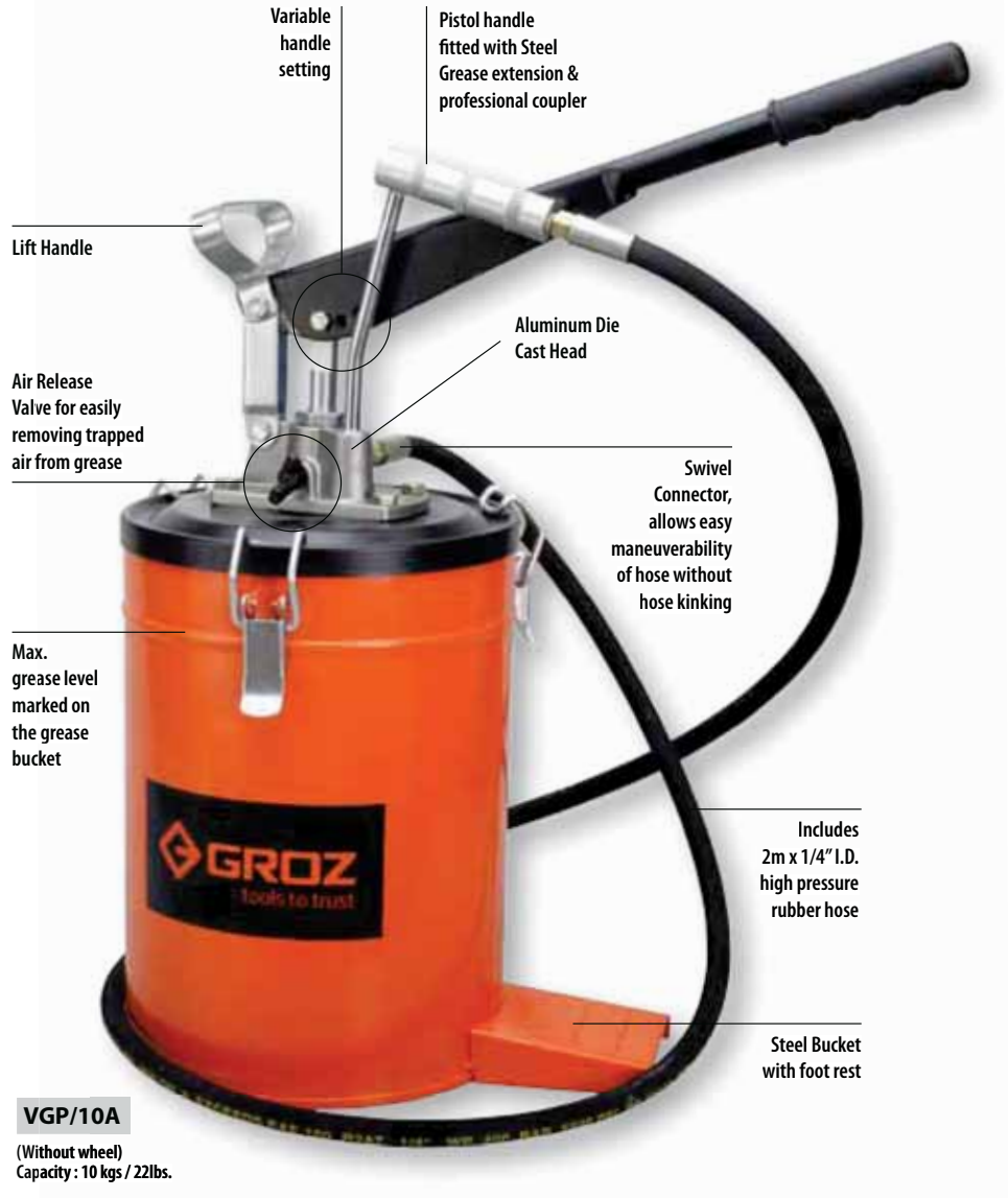
VGP/10A (Without wheel) Capacity: 10 kgs / 22lbs.